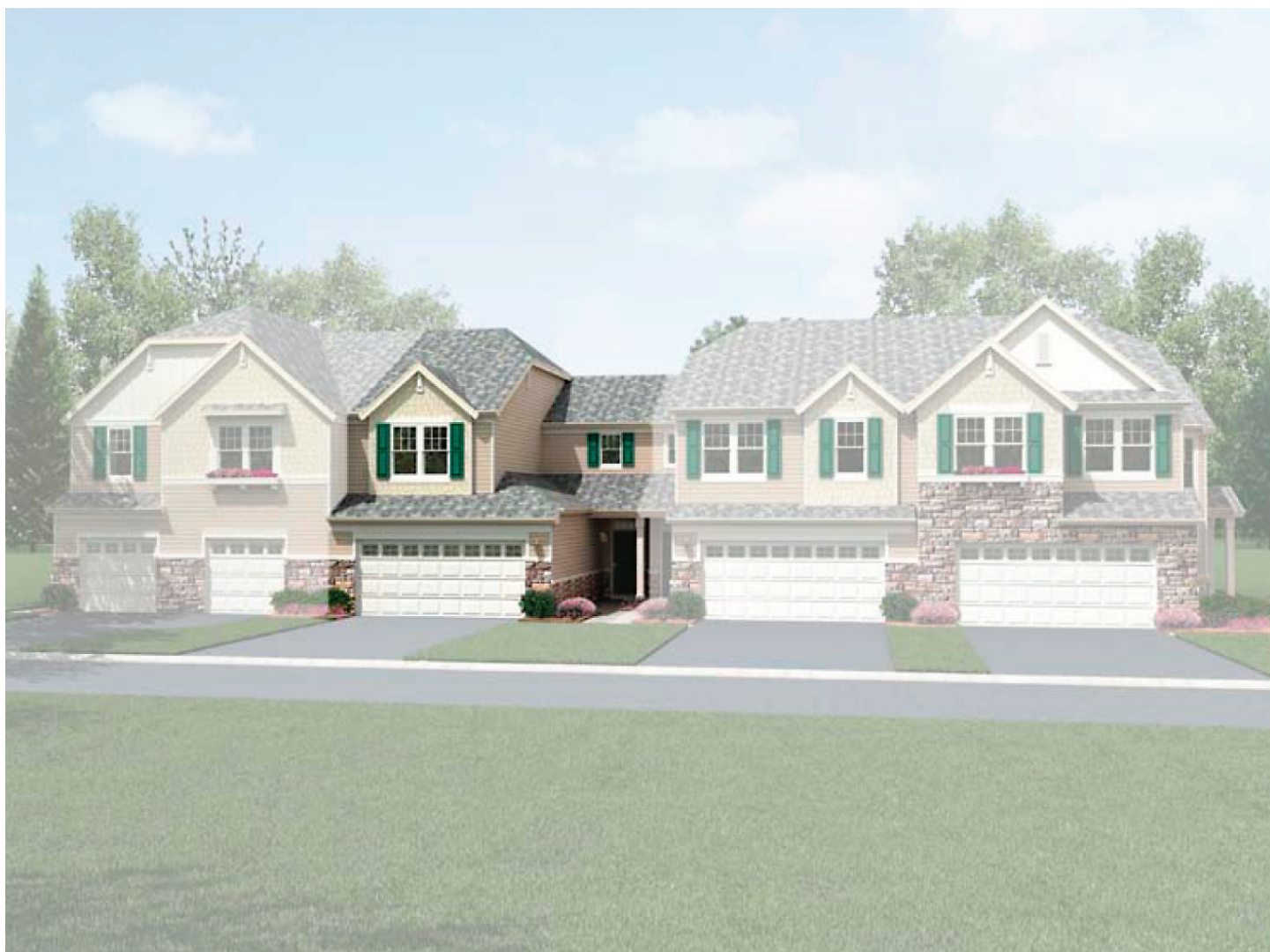
Illustration above including exterior styling, materials, color scheme, landscaping and exterior architecture of other units in the townhome building are artist's concept. Actual construction may vary from artist's depiction.

In a continuous effort to improve our product, developer reserves the right to change specifications, equipment features, dimensions, prices, and/or plans without notice. All dimensions shown are approximate and plans are not to scale.